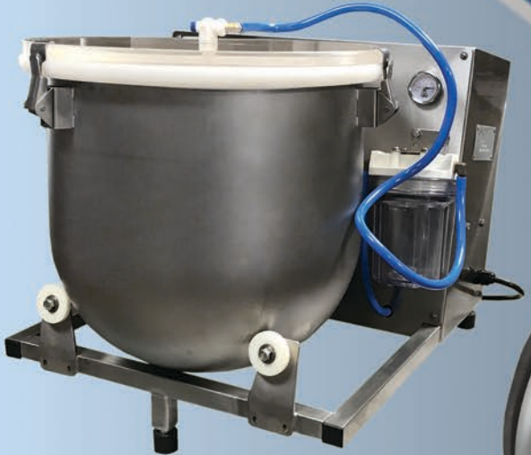
Pull a vacuum