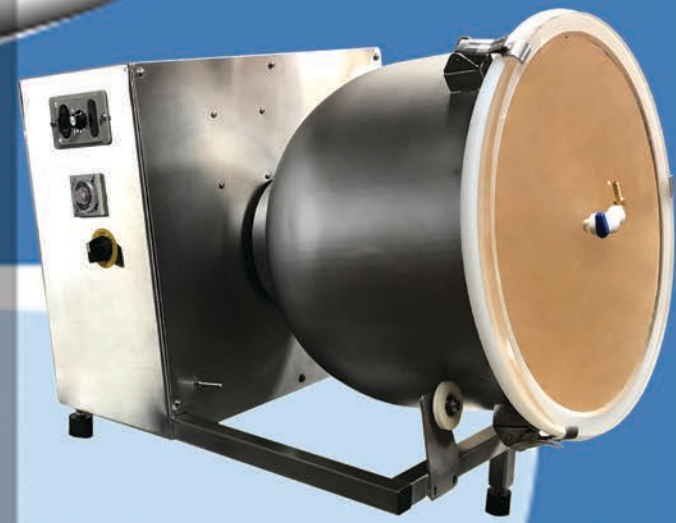
Marinate your meat product