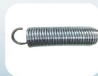
lid tension spring