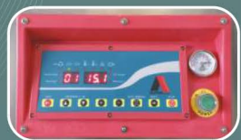
20 programs water proof panel with oil change and motor over indicator

Usage: Super market, restaruant, hospital, sea food, beef, cheese, chicken meat, lamb and ready meals