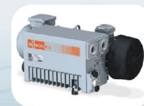
Busch vacuum pump