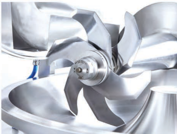
Knife Head with 6 standard knives BE-GW Steffens (Germany).