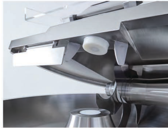
Smooth polished surfaces , no corners or screws, with C€ radius for easy cleaning.