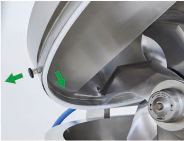
Removeable lid/bowl friction band to facilitate cleaning.