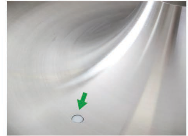
Bowl with drain plug for liquids .