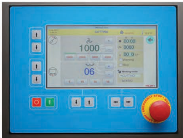
Digital display to control and program all functionalities of the cutter.