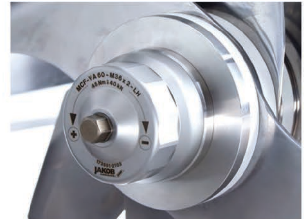
Talsa Quicklock reduces the time to dismantle and assemble the knives in the knife head.