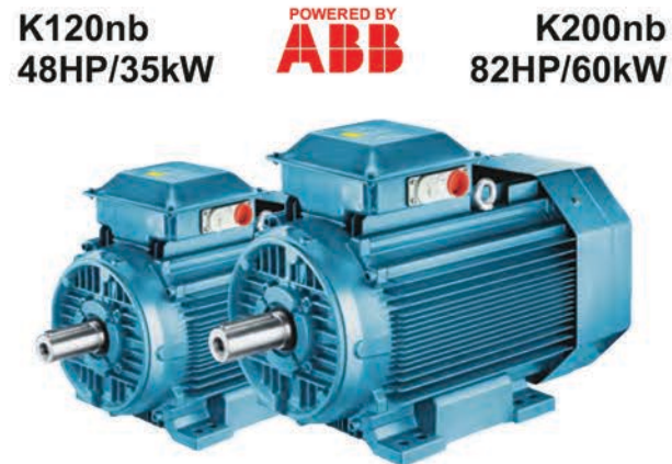
Powerful ABB knife motors for heavy applications.