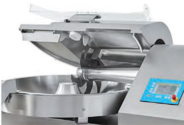
Stainless steel motorized knife lid for effortless lifting and lowering.