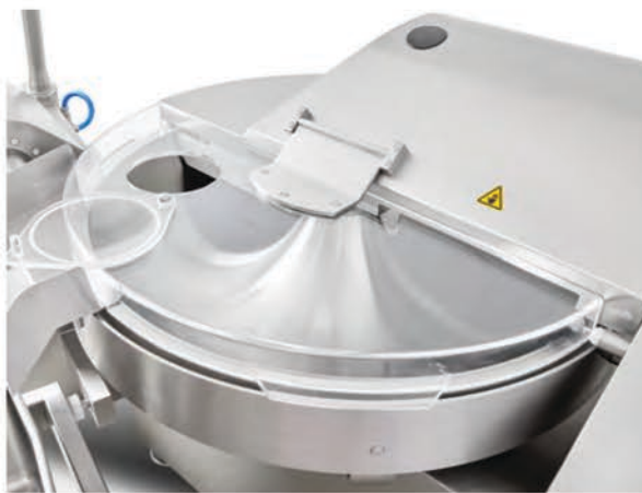
Noise protection cover with automatic decrease of knife speed. With opening to add spices without lifting the cover.