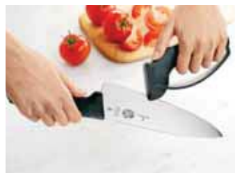
SwissSharp Handheld Sharpener