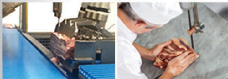
Automated Meat Bandsaw vs Manual Meat Bandsaw

Special safety features include the stainless steel safety cage and sensors to avoid risk to the operator.