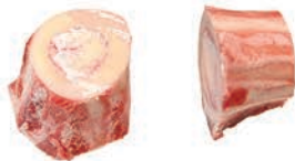
50mm Frozen Beef Femur