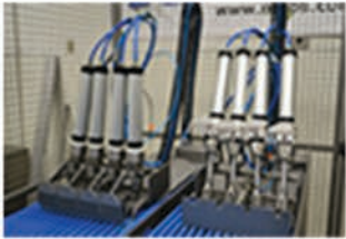
Fish and Meat Clamping Tool