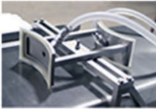
Round Cheese w/ Vacuum Clamping Tool