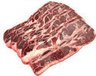
8mm Short Rib