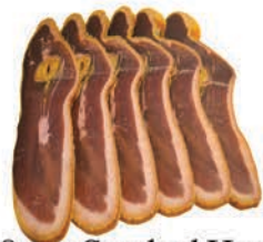
8mm Smoked Ham