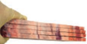
12mm Short Rib