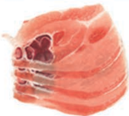
1mm Frozen Ham