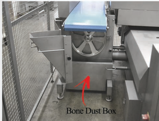
Bone Dust Box